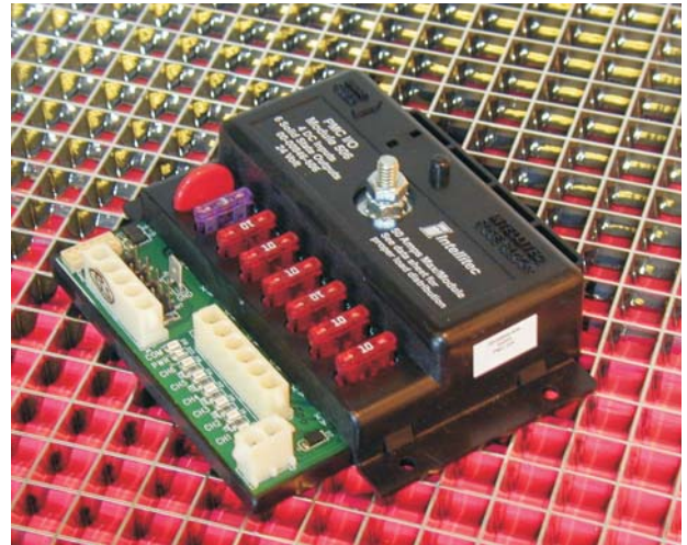
Dimensions 5-3/4 X 5 inches

If the module's circuit board exceeds 100° C, all outputs will turn off protecting the module. The COM LED will flash indicating that an over temperature condition exists. After cool down, and after power is removed and reapplied the module will return to normal function. The module will record the number of times overheating has occurred and upon initial power up the LED will flash the number of times the module has been overheated.