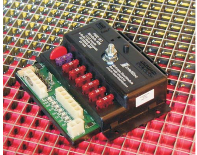
Dimensions 5-3/4 X 5 inches Pat. No. 4,907,222 & 6,011,997

This module should be installed in a protected environment, inside a vehicle.