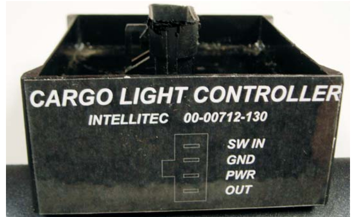
Part Number: 00-00712-130 (12V)

The Cargo Light Control/E is a water proof module, suitable for harsh environments. The electrical connections are made with a Packard Weather pack connector.