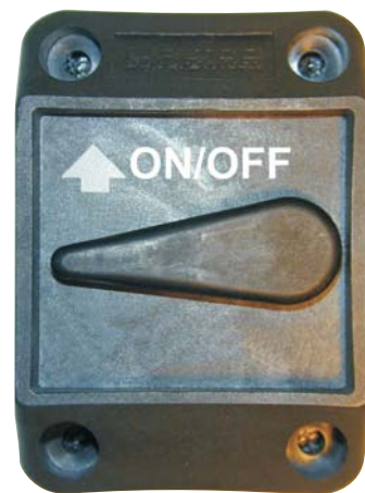
Part Number: 00-01010-000 Actual Size: 3.56" H X 2.5" W

The Cargo Light Control/E is activated by a momentary switch connected to ground. Intellitec offers a companion switch ( below ) to activate this control. This weather tight switch can be used in applications where washing down the interior of the truck is routinely performed.