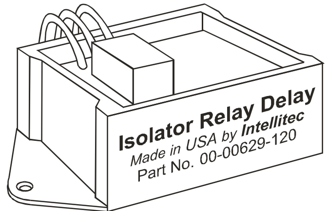
Part Number 00-00629-120 Actual Size: 1 1/2" X 3" X 1" high

It operates by sensing the voltage on the main 12 volt system. When this voltage goes above 13.3 volts for approximately 12 seconds, as happens when the engine is running normally (normal alternator output voltage is approximately 14.4 volts), it will close the isolator relay providing charging current to the auxiliary battery. When the ignition switch is turned off, the relay will open immediately.