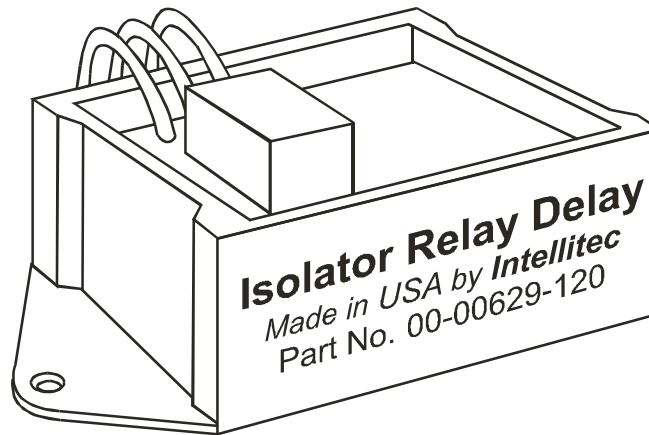
Isolator Relay Delay/E P/N 00-00629-120 (12V) P/N 00-00629-240 (24V)